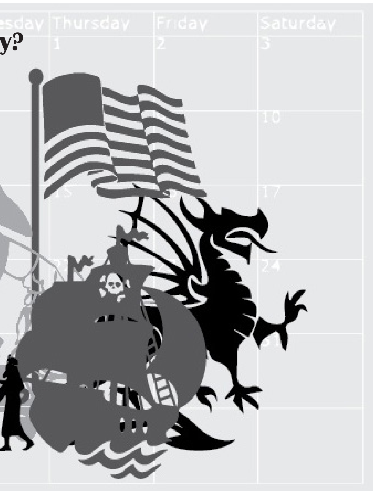
Illustration by Spenser Keener